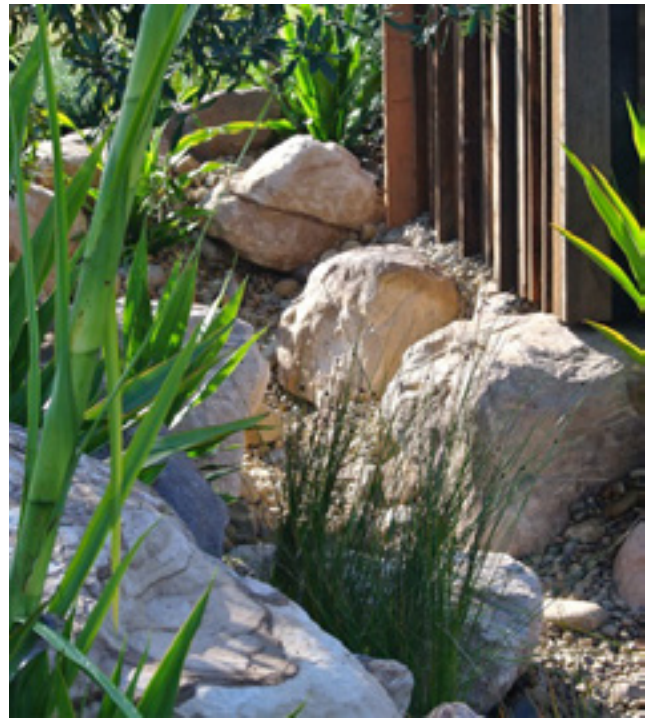
Design: Fisher Tomlin & Bowyer, Australian Garden Show Sydney 2013