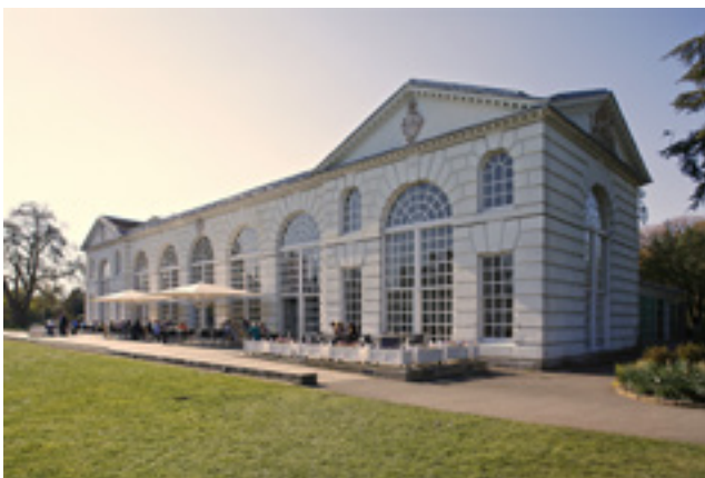
The Diploma Course is taught from the Orangery Conference Facility in the Royal Botanic Gardens, Kew.