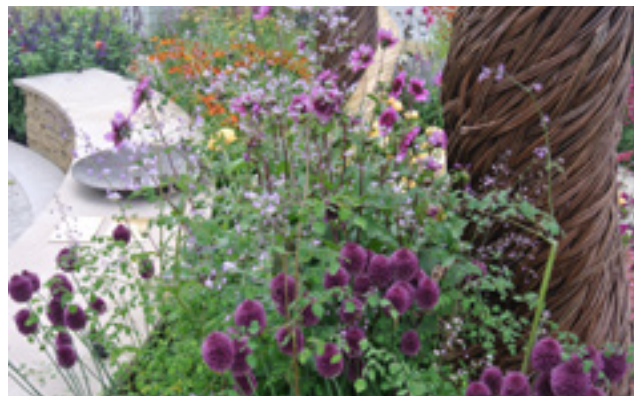
Design: Fisher Tomlin & Bowyer