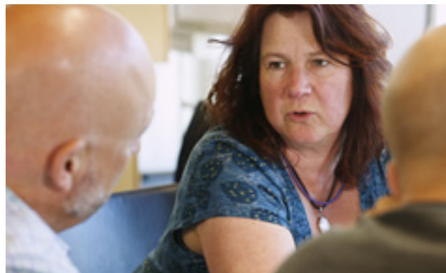
One-on-one studio training means plenty of tutor support

For more information go to our website www.lcmd.org.uk